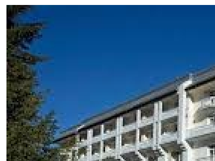
B&B Hotel – located in village center, five minutes to gondola. Bar, lounge, WIFI available, hair dryer in bathroom, cable TV in each room. Spa located next door.

$1,000 payment per person due upon registration. $1,250 payment per person due October 12 2025 Final payment per person due December 12, 2025 Make checks payable to "Charles E. Thompson" Sorry – No credit cards accepted. Checks or Venmo.